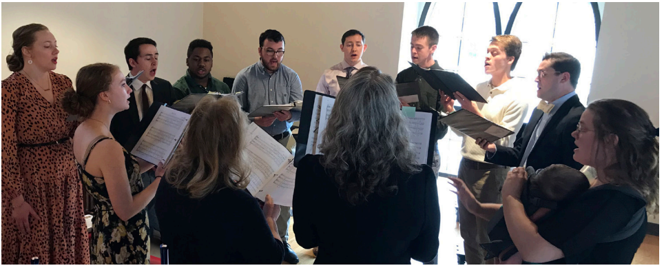
The ULC choir practicing in the choir loft. Our choir adds such beauty to worship at the chapel.