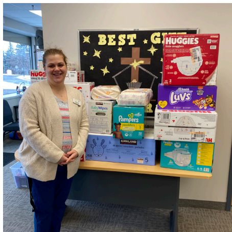
This past Christmas ULC had a diaper drive for New Day Pregnancy Center.