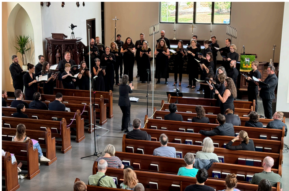
The U of M held its International Choral Academy concert at our chapel in August, featuring singers and conductors from around the globe.