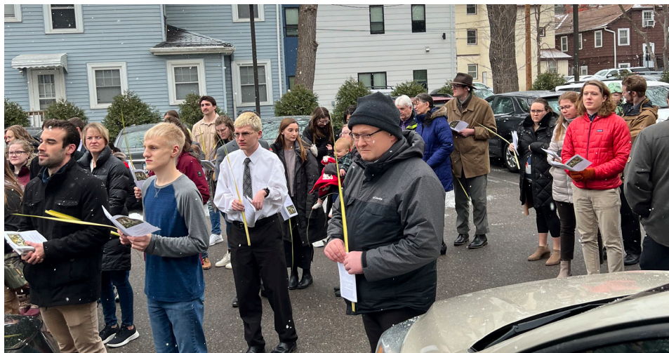
Palm Sunday Procession around the chapel. When it is fitting we love bringing the liturgy out into the neighborhood.